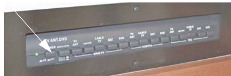
TV Signal Amplifier Switch (Located on Video Selection System)